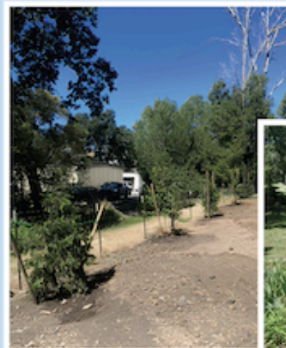
Trees were planted on a residential property as part of the restoration effort.