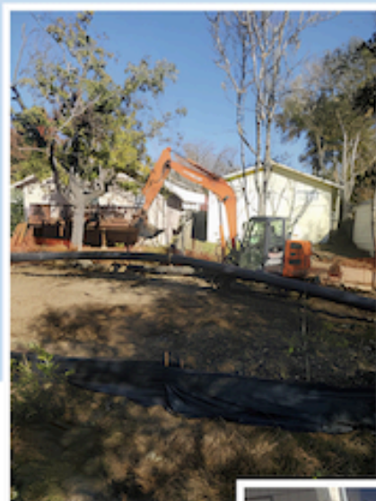
Homeowner on Pope Street allows construction to be completed within its property's easement. Restorative planting was completed.

The District extends gratitude to our neighbors and customers for their support during the project. Contractors had to access properties and obtain easement permits to complete work. Project completion within the set timeframe would have been difficult without property owner cooperation. Thank you!