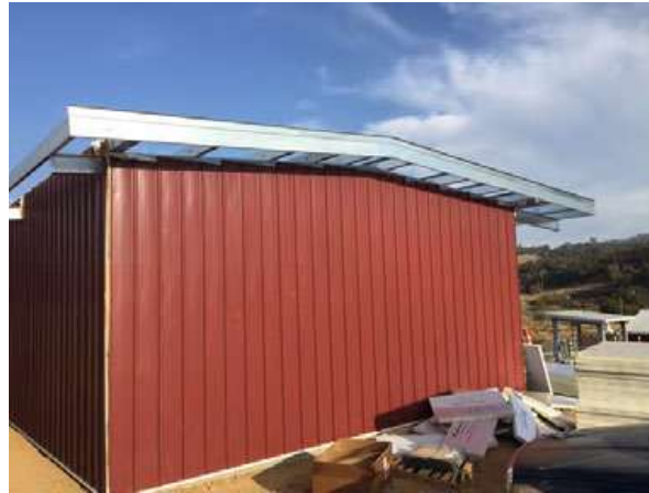
New Blower Building