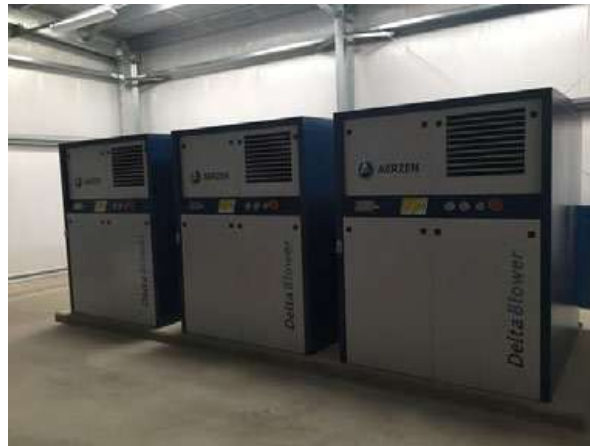
New Blower Units