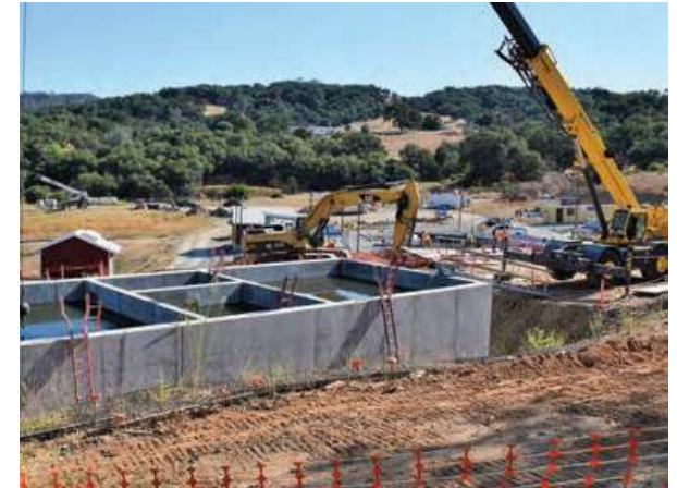
Foundation Work for Aerobic Digester