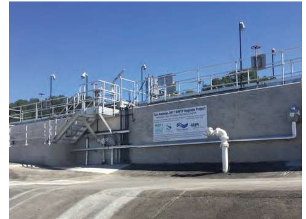
New Aerobic Digester Building