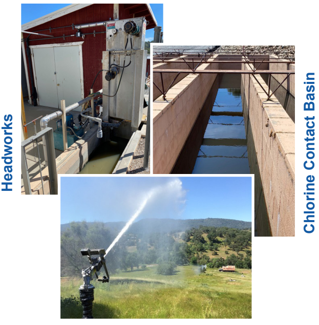
Irrigation Pump Station