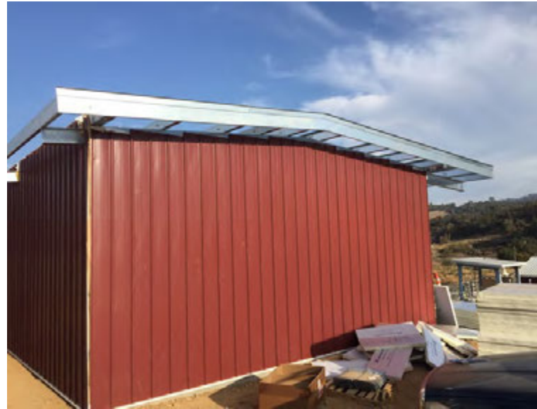
New Blower Building