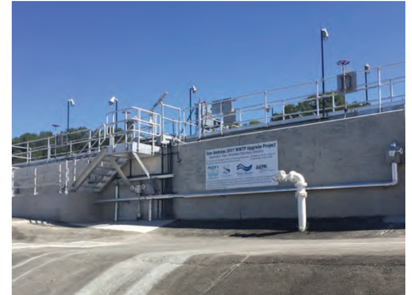
New Aerobic Digester Building