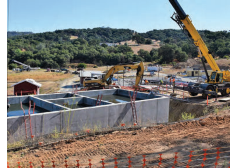
Foundation Work for Aerobic Digester