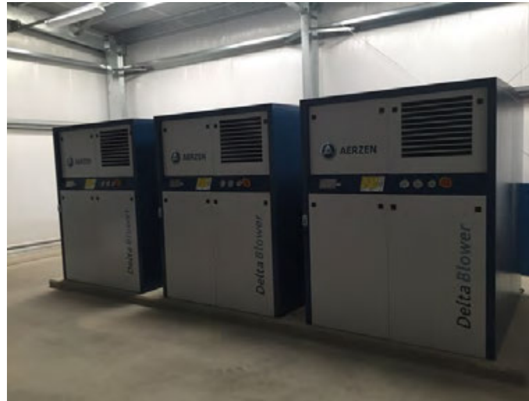
New Blower Units